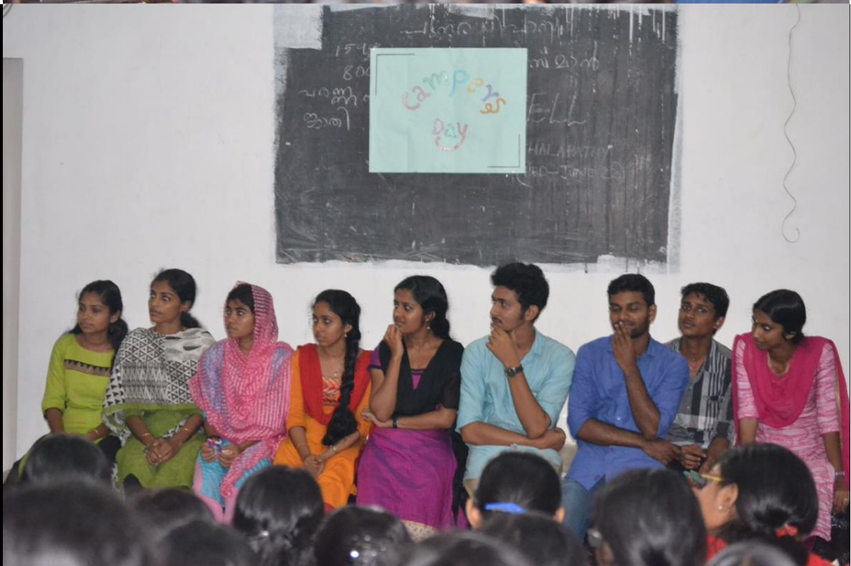
SELECTION OF NEW EXECUTIVES AND KEY HANDOVERING FUNCTION