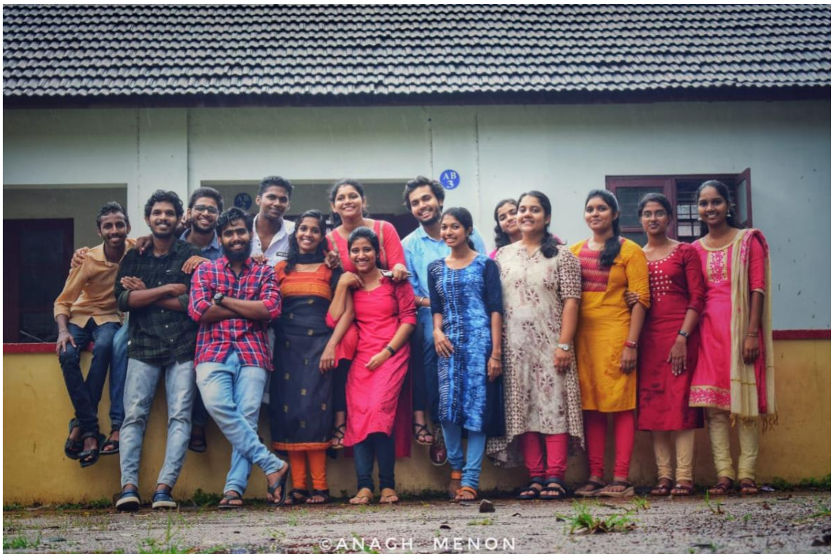
SENIOR EXECUTIVES 2017-18